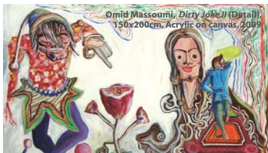
Omid Massoumi, Dirty Joke II (Detail) 150x200cm, Acrylic on canvas, 2009

For more info log on www.carbon12dubai.com