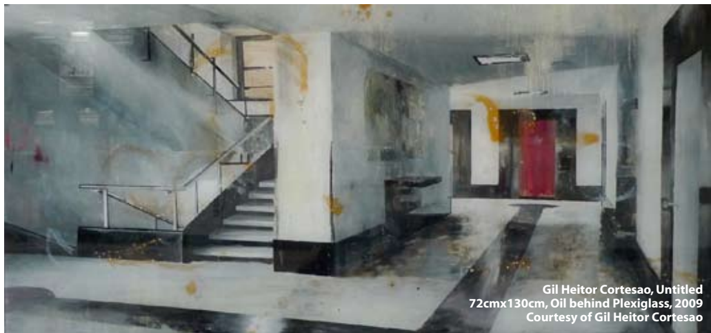
Gil Heitor Cortesao, Untitled 72cmx130cm, Oil behind Plexiglass, 2009 Courtesy of Gil Heitor Cortesao