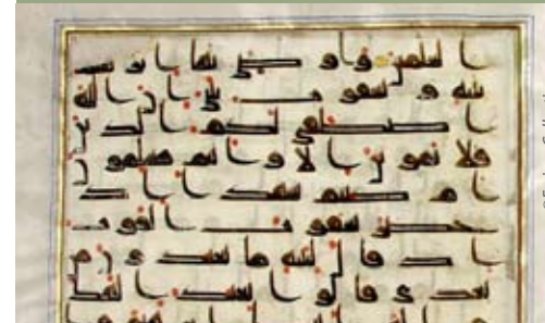
Quran (Detail) Arabic Manuscript in Kufic Script on Parchment Mesopotamia, 3rd Century AH / 9th Century AD

The Farjam Collection @ DIFC is generously supported by the Hafiz Foundation. Please visit www.farjamcollection.com for updates on events.